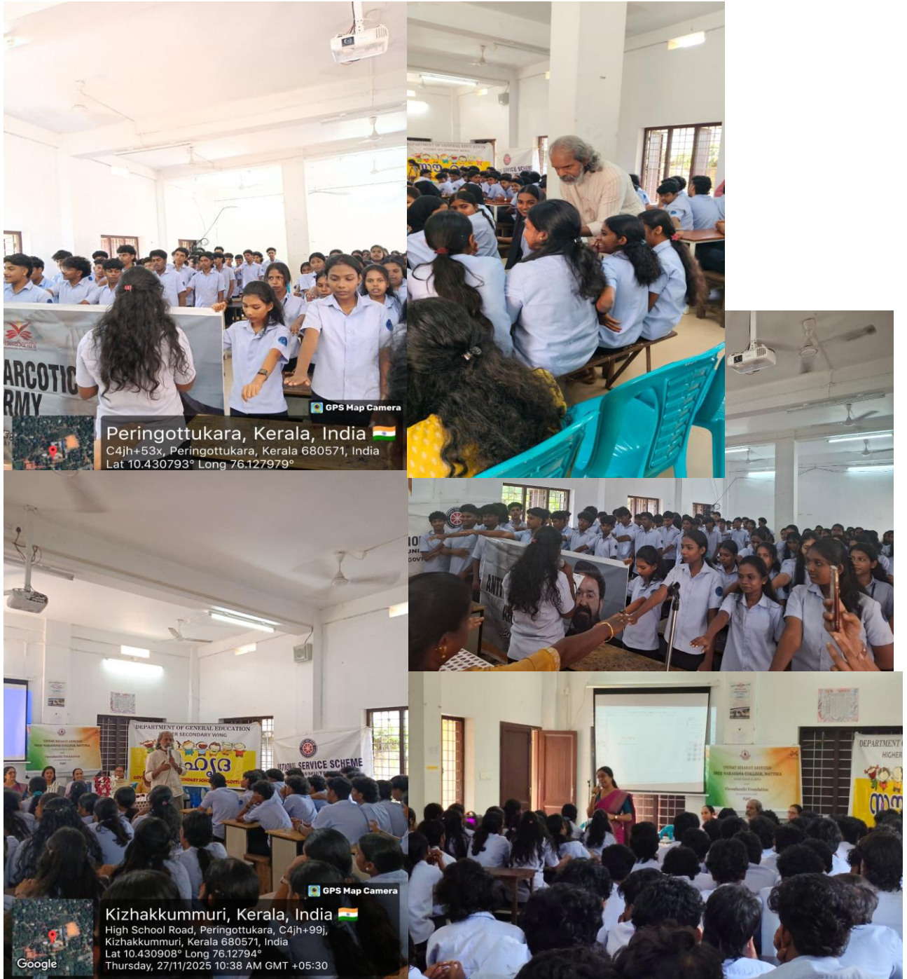
First session for class 12 th grade of Science and Commerce.