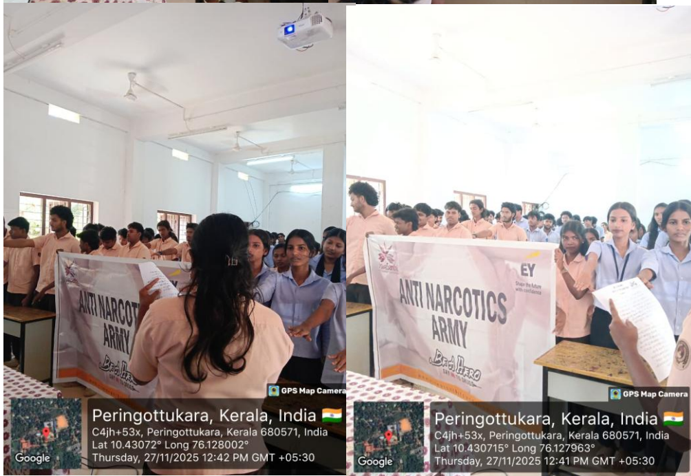
Second session for the class 11 th and 12 th Humanities.