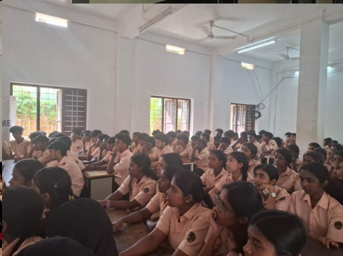
Third session for the class 11 th Science and Commerce.